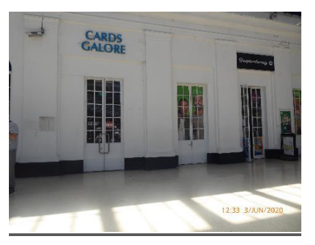
Figure 6. Unit 6, Left Hand Door