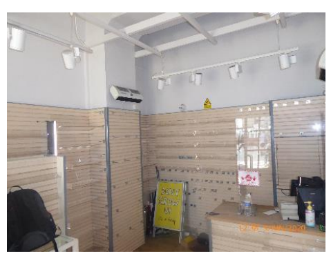
Figure 7. Unit 6, Interior