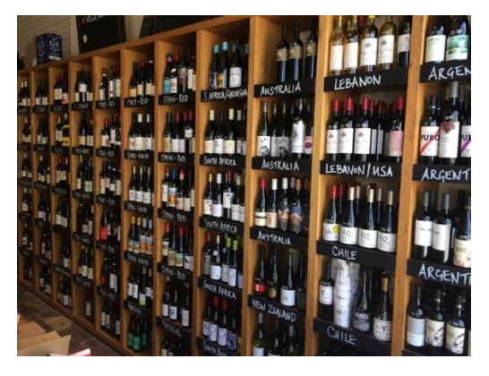
Figure 2. Seven Cellars, 104a Dyke Road inside shelving

Figure 1. Seven Cellars, 104a Dyke Road, BN1 3JD