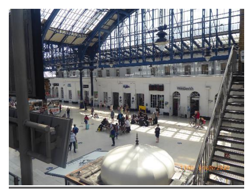
Figure 5. Unit 6, left of Superdrug

Unit 6 is a very small shop, measuring 341 cm x 500 cm and we mean to refurbish to an extremely high standard with a luxury, premium feel. We will be using wooden shelving and employing local businesses to help us to carry out the shop-fit. We envisage that the shop-fit will take 4 weeks to complete and this will be undertaken in times of low foot-fall outside of busy travel times.